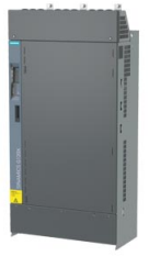
图像类似 / Figure similar