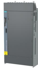
图像类似 / Figure similar